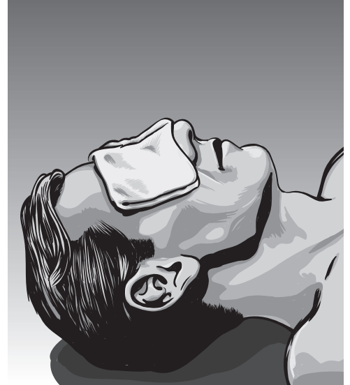
Apply cool compress over the closed eye lids.