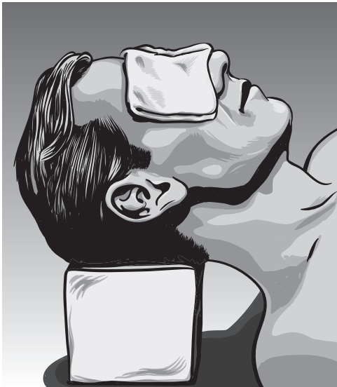
Keep head elevated!