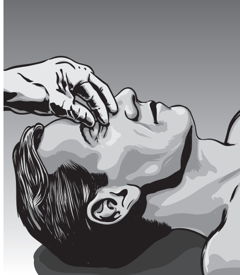
Close the eye lids.