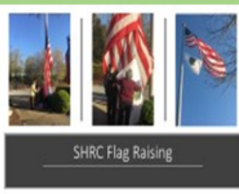
SHRC Flag Raising