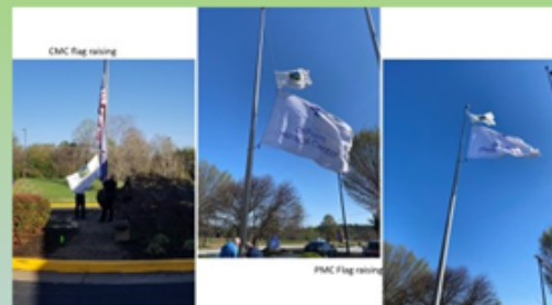
CMHC flag raising