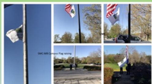
SMC-MB Campus Flag raising